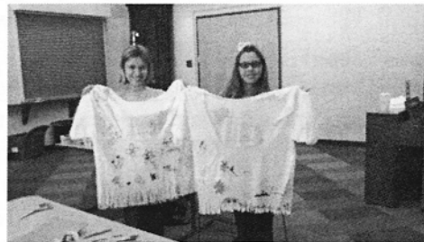
In June, thirty teenagers designed and colored their own individual tee shirts during a teen craft event. The tee-shirts were donated by Palomar Pomerado Health; the program was underwritten by the Friends of the Valley Center Library.